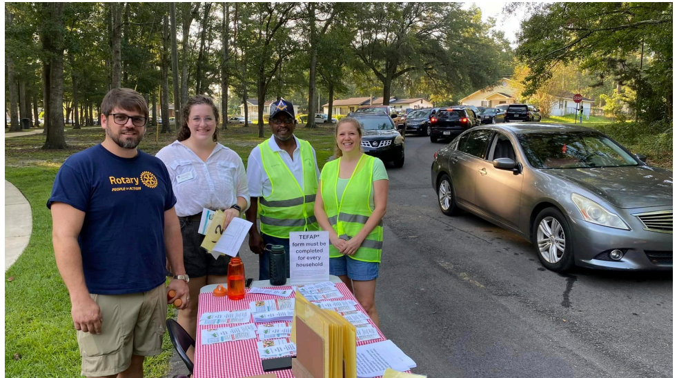
One hundred vehicles were already lined up prior to opening the Fresh Produce Market that morning!