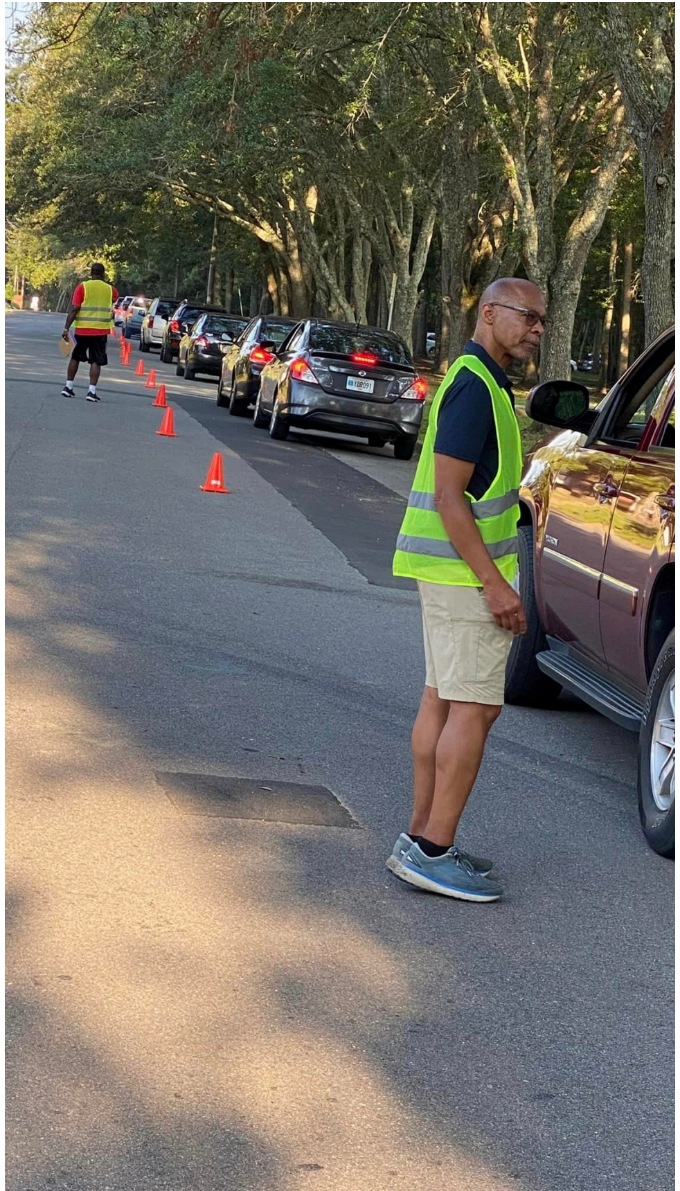
Each household received a variety of fresh and frozen foods, including collards, zucchini, sweet potatoes, blueberries, peaches, oranges, strawberries, and chicken.