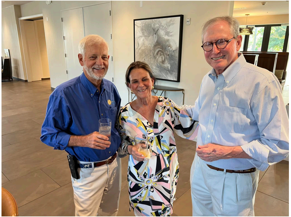
In an effort to grow our membership, every 1st Tuesday of the month we host a social called "Wine or Whine" and August's Wine or Whine social was a HIT!