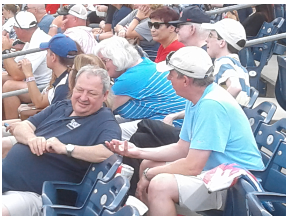
Join your family of Dunwoody: