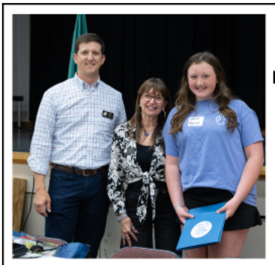
Crabapple Middle School Student of the Year