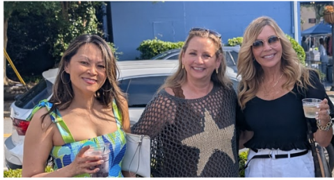
Alive in Roswell